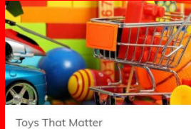
Toys That Matter