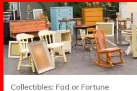
Collectibles: Fad or Fortune