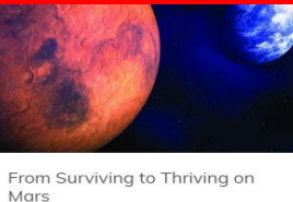
From Surviving to Thriving on Mars