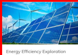
Energy Efficiency Exploration