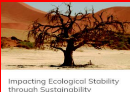
Impacting Ecological Stability through Sustainability