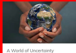
A World of Uncertainty