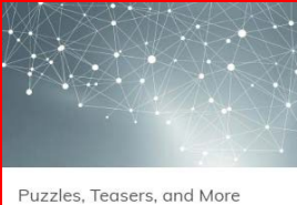
Puzzles, Teasers, and More